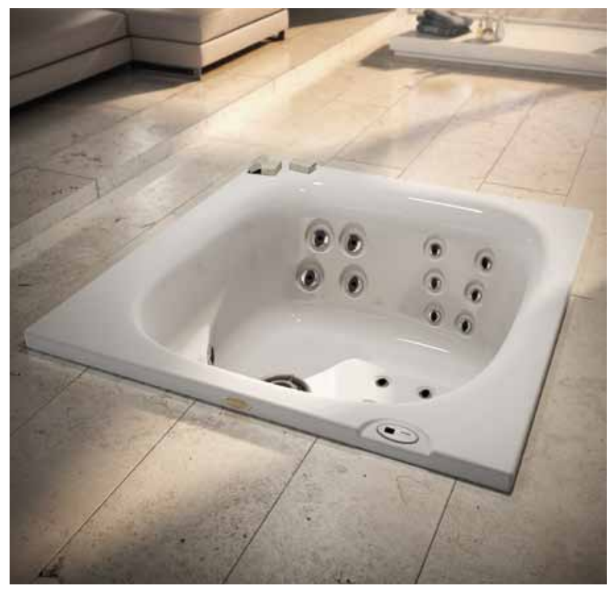
City<sup>™</sup> Spa built in