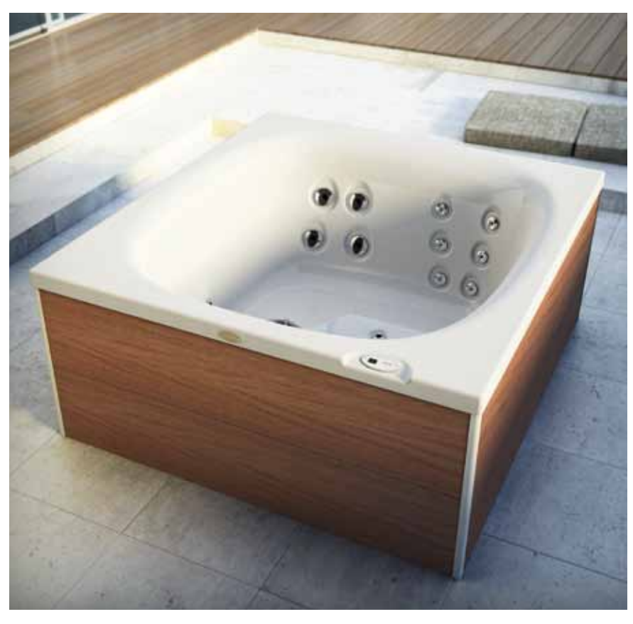
City<sup>™</sup> Spa freestanding, panels in wood or synthetic wood

Ideal for small gardens or terraces and sized to fit comfortably through a doorway this hot tub is revolutionary in the true spirit of Jacuzzi® brand and will provide you with the means to get the most out of each moment of life in the city.